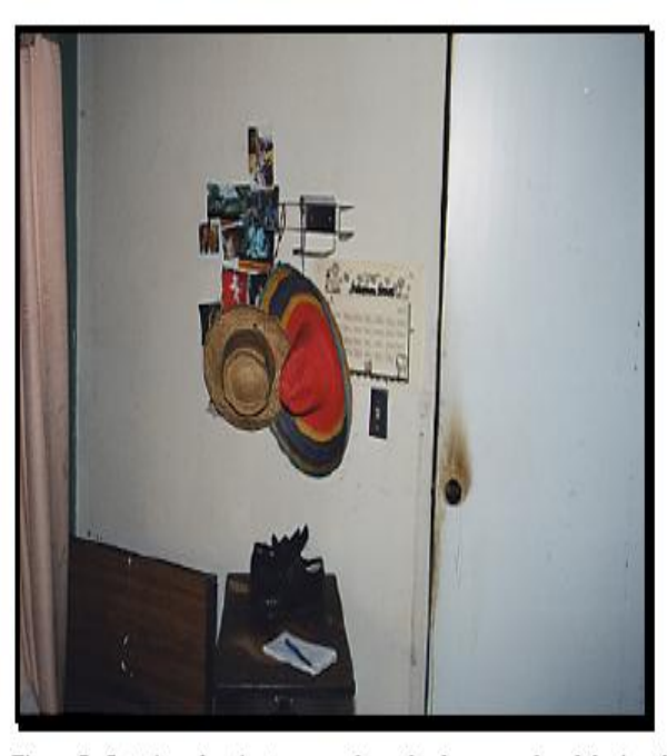
Figure 7 - Interior of patient room, where the door was closed during the fire (NFPA)