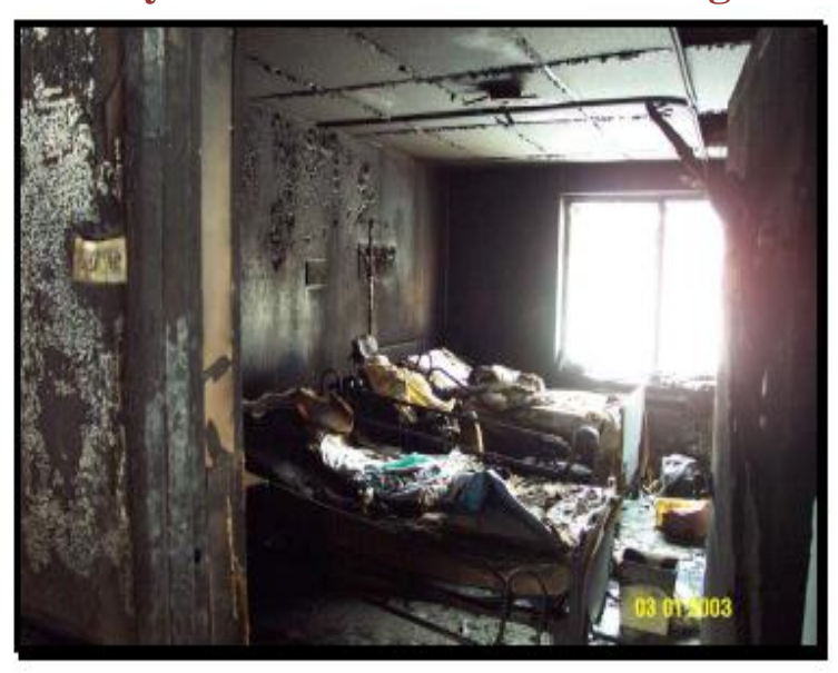
Figure 5 - Patient room (204) where the door was open during the fire